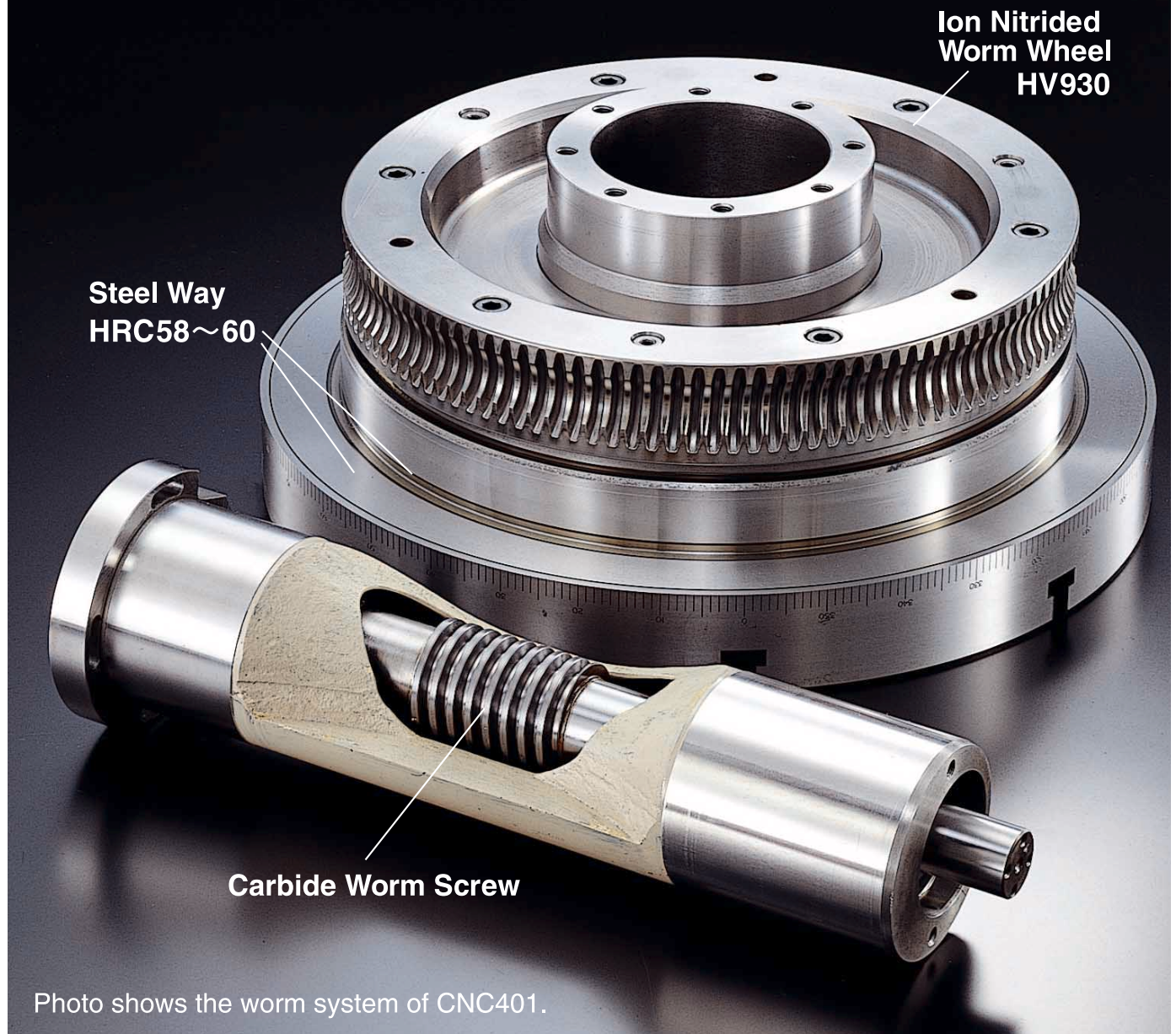
Photo shows the worm system of CNC401.

Worldwide Field-proven NIKKEN CNC Rotary Table. Consequently and finally, NIKKEN Carbide Worm Screw System.